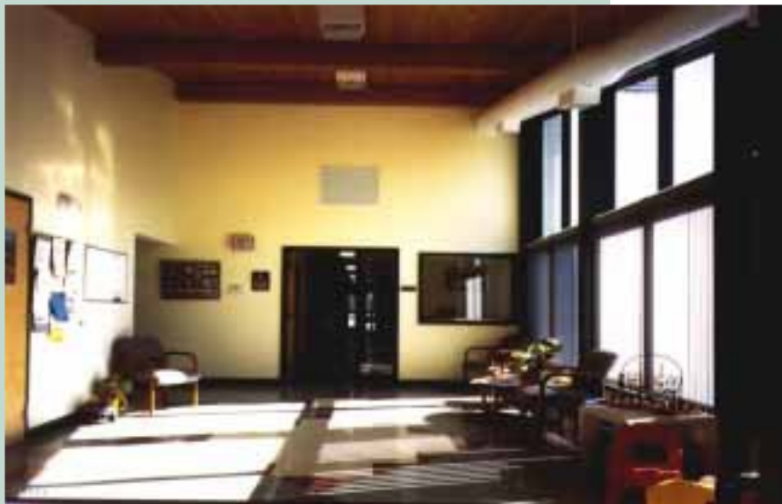
View of Lobby

The building's roof line remains low, however entrances are marked with shed roofs to direct rain water away. Their position, and that of other openings, have been located for protection from prevailing winds and weather.